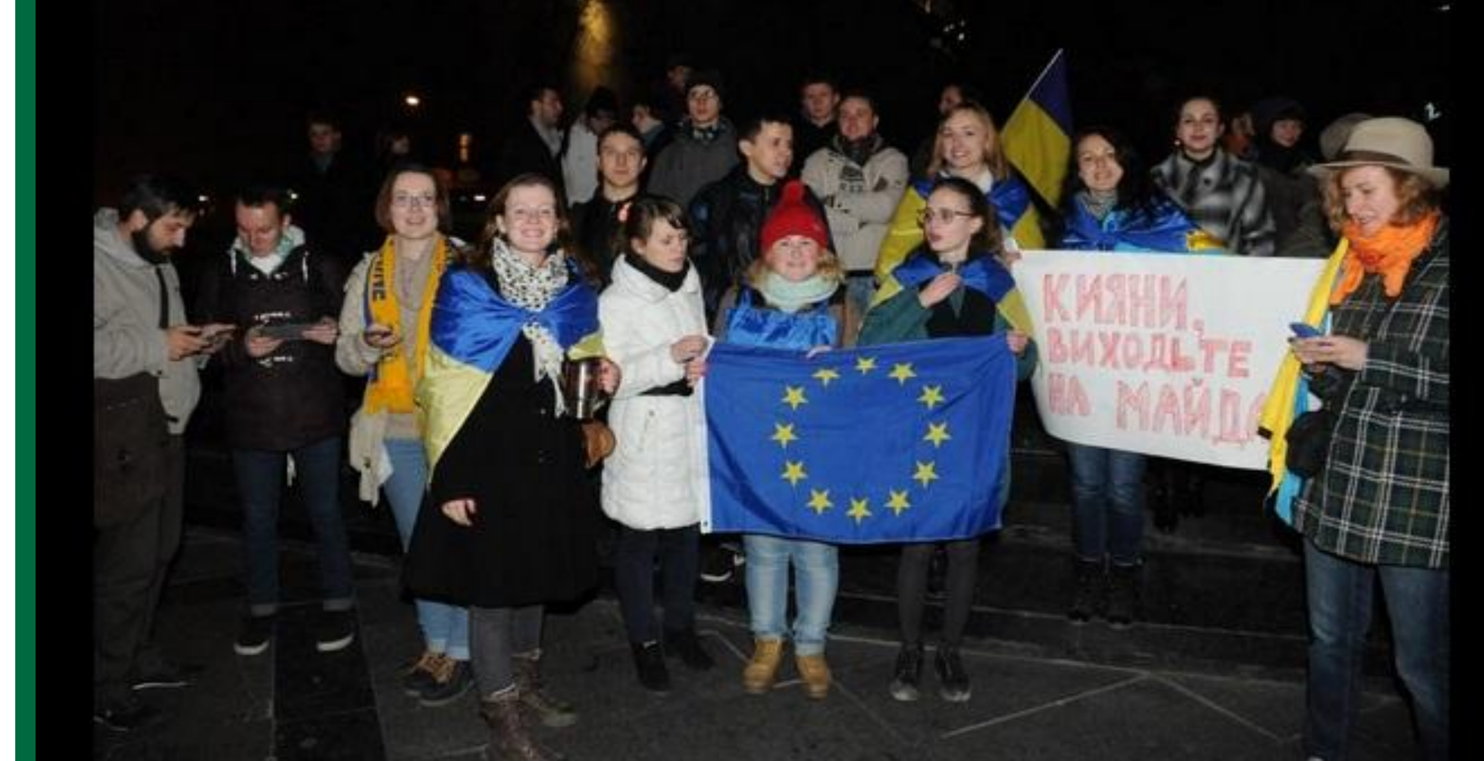
Євромайдан Львів @euromaidanlviv · Nov 21 #Львів 21.11.2013 Перші Люди які вийшли на заклик підтримати #Євромайдан