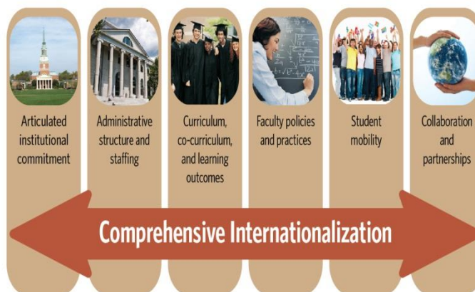
ACE Comprehensive Internationalization Diagram