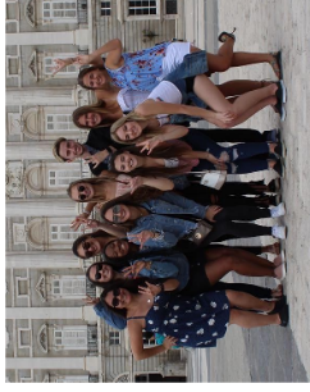
Top 10 in the nation for students studying abroad