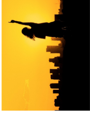
No. 1 in the U.S. for innovation ahead of Stanford and MIT

ASU engages with people and issues locally, nationally and internationally.