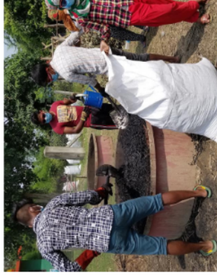
ASU Design aspiration number 8: Engage Globally