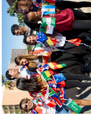
No. 1 public university chosen by international students